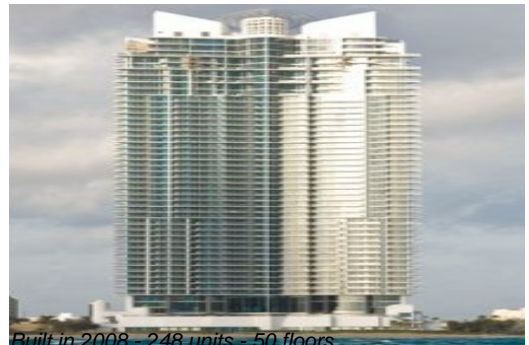
Built in 2008 - 248 units - 50 floors