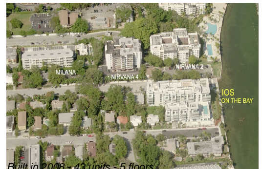
Built in 2008 - 43 units - 5 floors