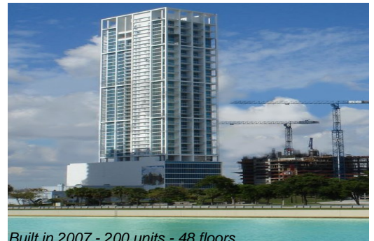
Built in 2007 - 200 units - 48 floors