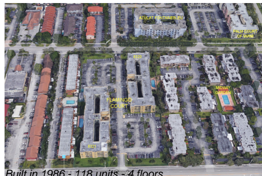
Built in 1986 - 118 units - 4 floors