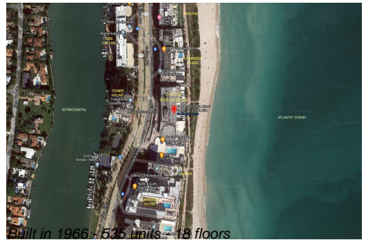
Built in 1966 - 535 units - 18 floors