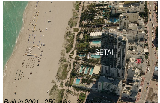
Built in 2001 - 250 units - 39 floors