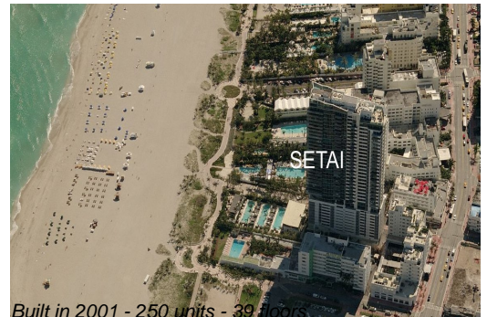
Built in 2001 - 250 units - 39 active listings