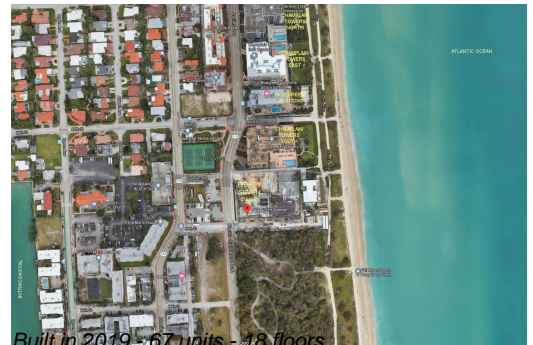
Built in 2019 - 67 units - 18 floors