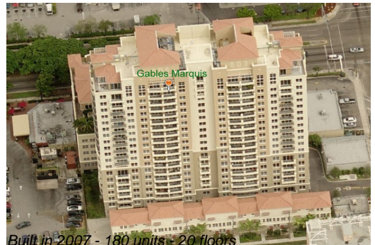
Built in 2007 - 180 units - 20 floors