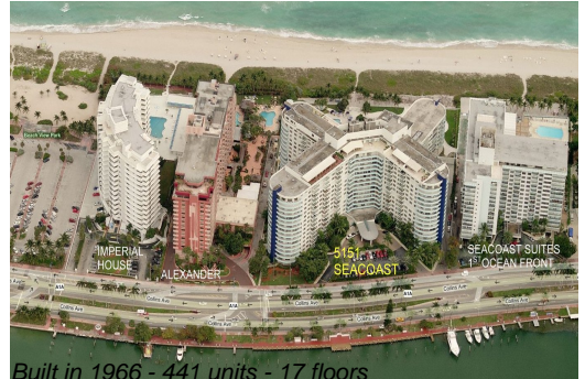
Built in 1966 - 441 units - 17 floors