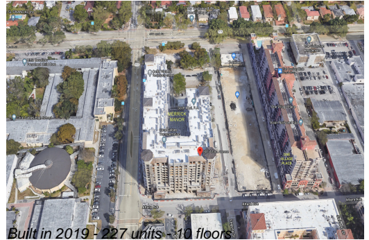
Built in 2019 - 227 units - 10 floors

The above valuated price is a baseline figure that does not take into account any specific renovation, upgrade, split, merge, or deterioration of the unit.