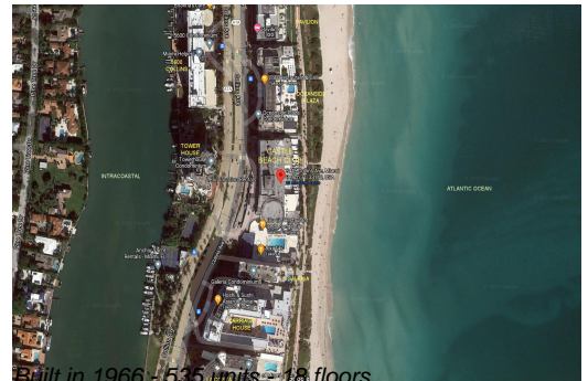
Built in 1966 - 535 units - 18 floors