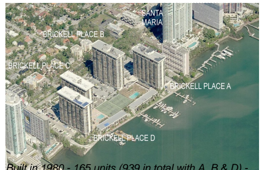
Built in 1980 - 165 units (939 in total with A, B & D) - 18 floors