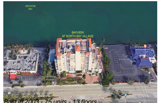
Built in 2003 - 75 units - 13 floors