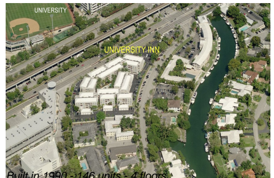
Built in 1990 - 146 units - 4 floors