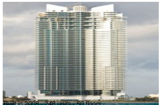
Built in 2008 - 248 units - 50 floors