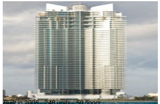
Built in 2008 - 248 units - 50 floors