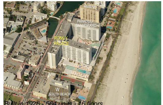
Built in 1926 - 564 units - 16 floors