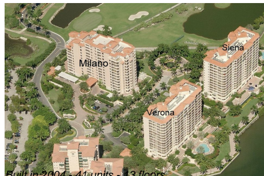
Built in 2004 - 41 units - 13 floors