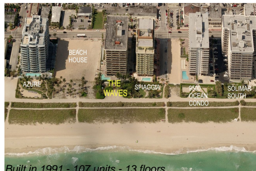
Built in 1991 - 107 units - 13 floors