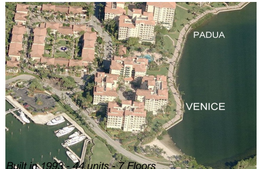
Built in 1993 - 44 units - 7 Floors