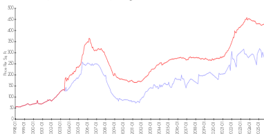
Kennedy House vs North Bay Village