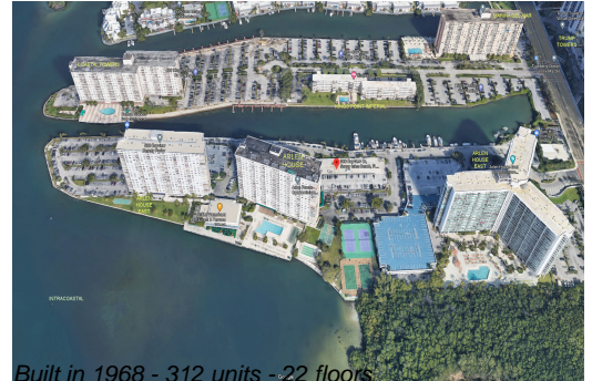
Built in 1968 - 312 units - 22 floors