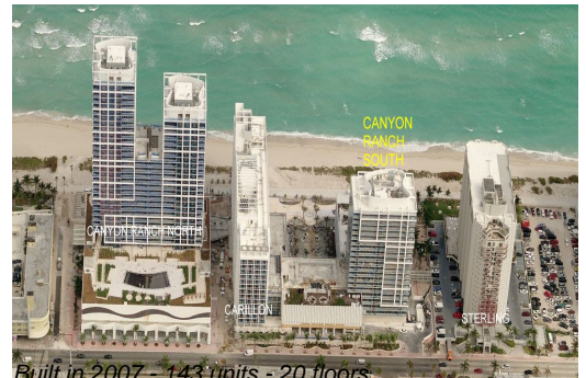
Built in 2007 - 143 units - 20 floors