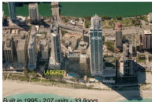
Built in 1995 - 207 units - 33 floors