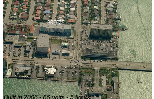
Built in 2006 - 66 units - 5 floors