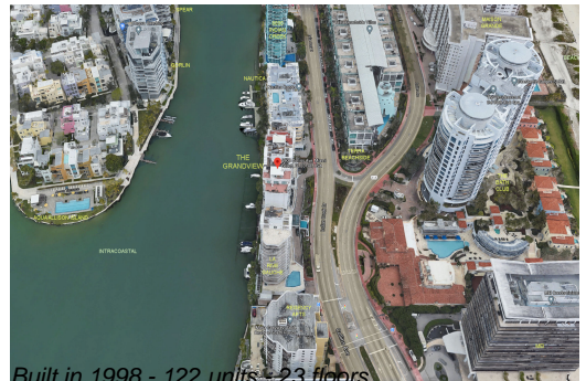
Built in 1998 - 122 units - 23 floors