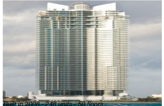
Built in 2008 - 248 units - 50 floors