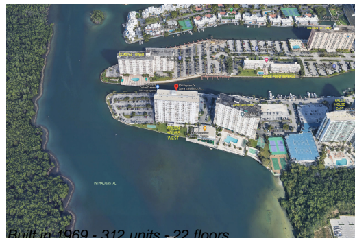
Built in 1969 - 312 units - 22 floors