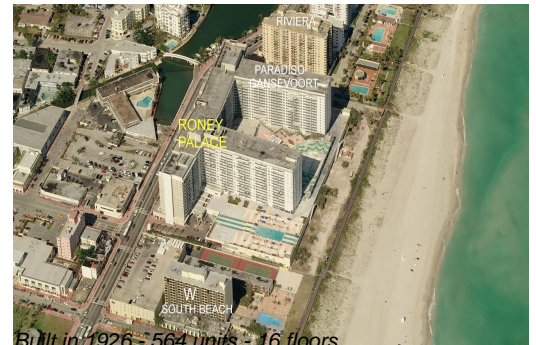
Built in 1926 - 564 units - 16 floors