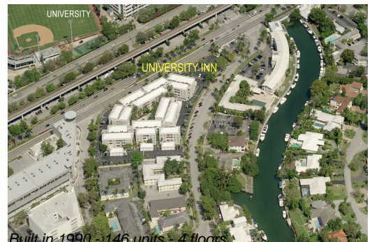
Built in 1990 - 146 units - 4 floors