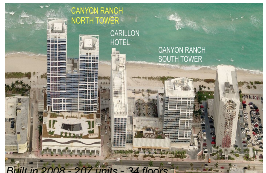
Built in 2008 - 207 units - 34 floors