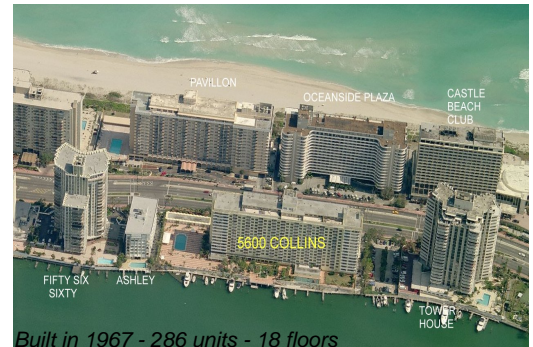
Built in 1967 - 286 units - 18 floors

The above valuated price is a baseline figure that does not take into account any specific renovation, upgrade, split, merge, or deterioration of the unit.