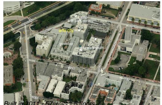
Built in 2011 - 57 units - 5 floors