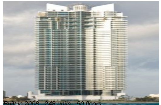
Built in 2008 - 248 units - 50 floors