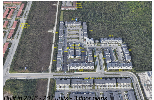
Built in 2016 - 201 units - 3-floor plans