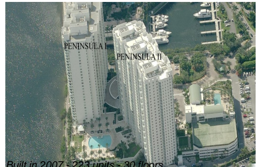
Built in 2007 - 223 units - 30 floors