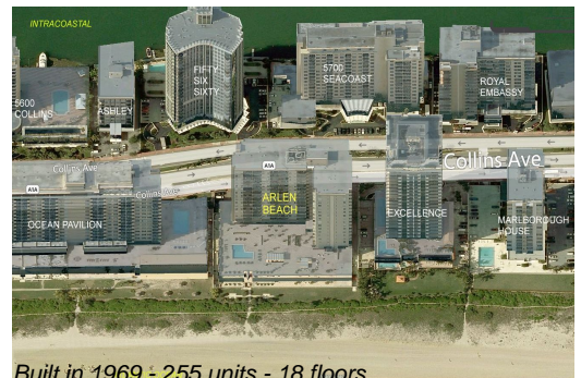
Built in 1969 - 255 units - 18 floors