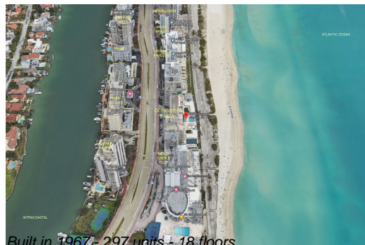
Built in 1967 - 297 units - 18 floors