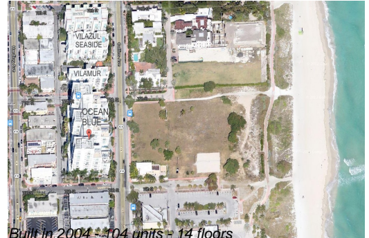
Built in 2004 - 104 units - 14 floors