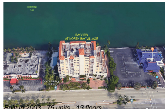
Built in 2003 - 75 units - 13 floors