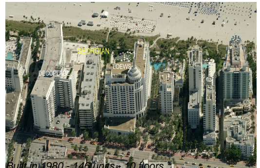
Built in 1980 - 146 units, 10 floors