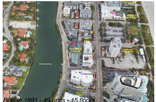
Built in 1991 - 49 units - 15 floors