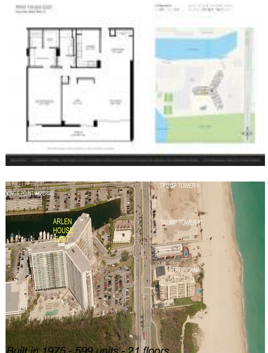
Built in 1975 - 599 units - 21 floors