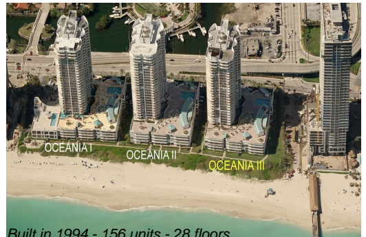
Built in 1994 - 156 units - 28 floors