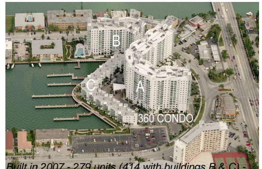
Built in 2007 - 279 units (414 with buildings B & C) - 15 floors