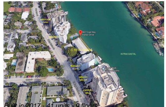
Built in 2017 - 41 units - 9 floors