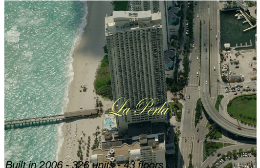
Built in 2006 - 326 units - 43 floors