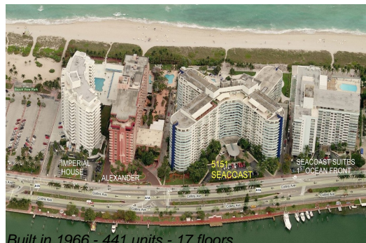
Built in 1966 - 441 units - 17 floors