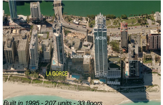
Built in 1995 - 207 units - 33 floors